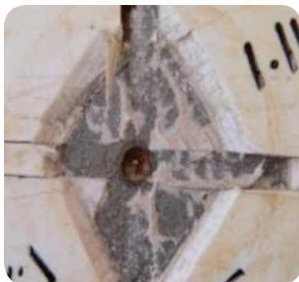
FIGURE 1 A thick 3LPP sample after cathodic disbondment testing for 48 h at -1.5 V and 95 °C.

Although it was found that cathodic disbondment test specimen geometry, whether