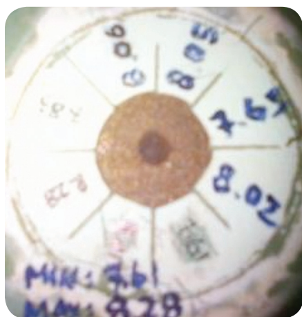
FIGURE 3 A FBE sample after cathodic disbondment testing for 28 days at -1.5 V and 65 °C (holiday depth = 0.1 mm).

alone. FBE as a primer for three-layer coatings has a thickness that is normally significantly lower than the thickness of FBE as a standalone coating. Application temperature and quenching effects are often significantly different between multilayer polyolefin coatings and standalone FBE. These factors can result in significantly different results. The acceptance criteria need to be different.